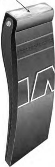
CORRECT APPLICATION OF LUBRICANT